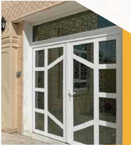
UPVC Windows and Doors