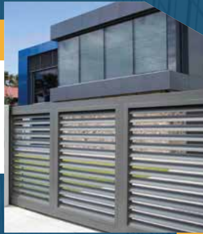
Steel Doors, Windows, and Fences