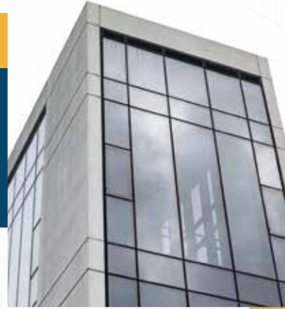
Structural and Curtain Wall Facades