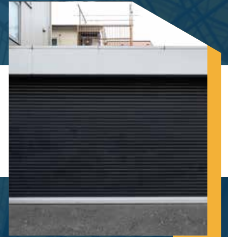
Automatic Gates and Photocell Systems