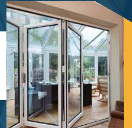
Folding Systems (All Types)