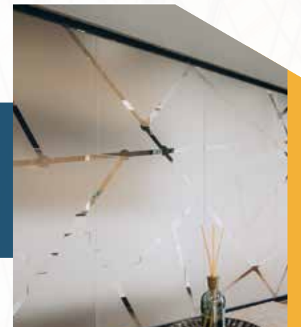
Tempered Glass (Handrails, Partitions, and Shower Enclosures)